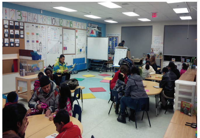
Primary students and their families snuggle up and read.